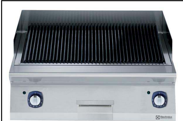
371240 (E7GREHGS0U) Full module electric Grill Top